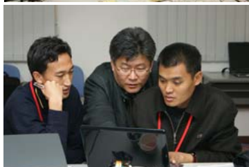
Workshop and Team project, Kyoto, 2008