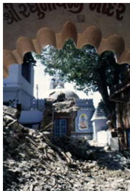
Damaged Cultural Heritage by Earthquake (Gujarat, 2001)

Recently natural and man-made hazards such as earthquakes, fires and terrorism have caused serious and irreversible damage to cultural heritage. Therefore, comprehensive risk management is essential for the protection of cultural heritage from disasters. In this light, the Cultural Heritage and Risk Management project of Ritsumeikan University Research Center for Disaster Mitigation of Urban Cultural Heritage (Rits DMUCH) aims to organize the UNESCO Chair International Training Programme and develop a scientific support network, in order to build the institutional capacity needed to formulate comprehensive risk management plans that are based on the characteristics of cultural heritage and nature of hazards in the regional context.