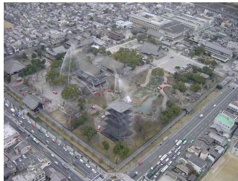
Firefighting Training at Toji-Temple (Kyoto) in 26 January 2004 (Cultural Properties Fire Prevention Day) Photo reference: Kyoto City Fire Department No. 160157 pp. 13

Dates : 5 th to 17 th November 2007 Place : Kyoto, Japan