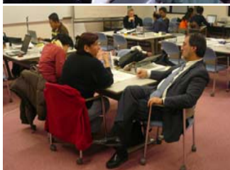
Group work and Team project, Kyoto, 2007