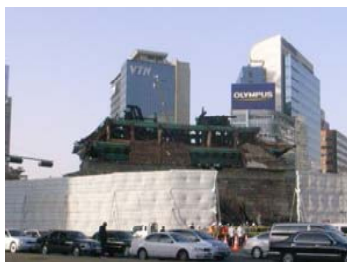
Fire of the Sungnyemun (Namdaemun Gate, National Treasure No.1) In Seoul, Korea (12 Feb. 2008)

Protection of cultural heritage is essential to the conservation of cultural diversity. Recently natural and man-made disasters have caused serious and irreversible damages to cultural heritage. Therefore, a comprehensive risk management including risk preparedness, emergency response and recovery, is essential for the protection of cultural heritage from disasters. In this light, the Cultural Heritage and Risk Management project of Ritsumeikan University Research Center for Disaster Mitigation of Urban Cultural Heritage (Rits DMUCH) aims to provide an international training programme and to develop a scientific support network, in order to build institutional capacity needed to formulate comprehensive risk management plans that are based on the characteristics of cultural heritage in the regional context.